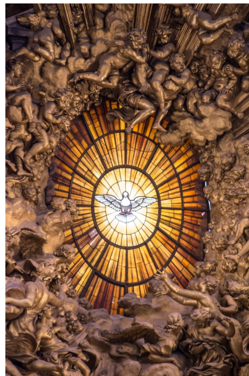
Holy Spirit window in St. Peter's Basilica. Pentecost May 28, 2023