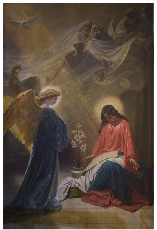
The Annunciation to Mary Domenico Bruschi (1886) Metropolitan Cathedral of Mdina, Malta March 25