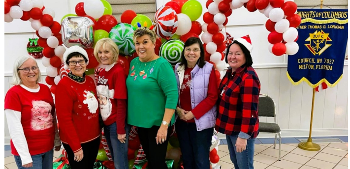
Many thanks go to the Saint Rose

The fifty guests in attendance were hosted by five knights and six ladies.