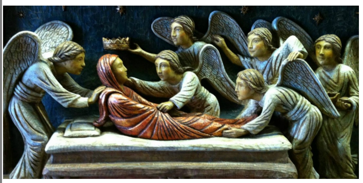
August 15, is the Solemnity of the Assumption of the Virgin Mary ,

Next month we'll look at The Great East/West Schism of 1054