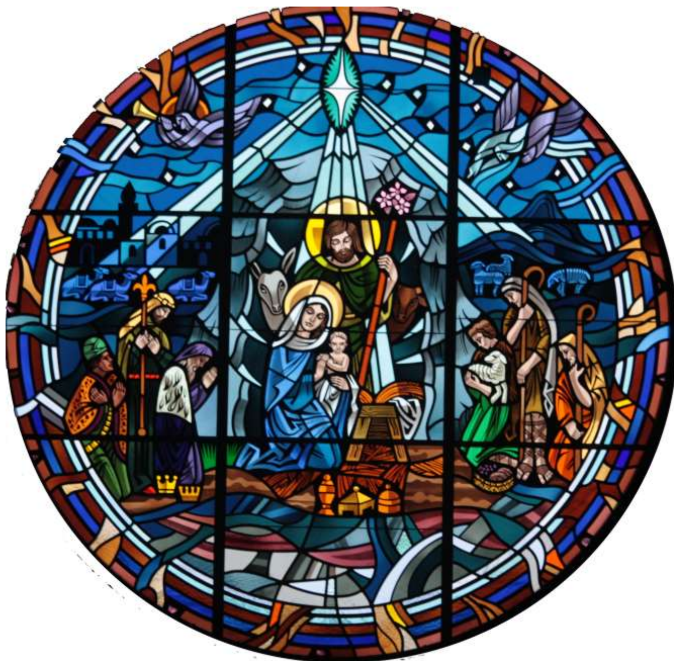
The Nativity of Our Lord